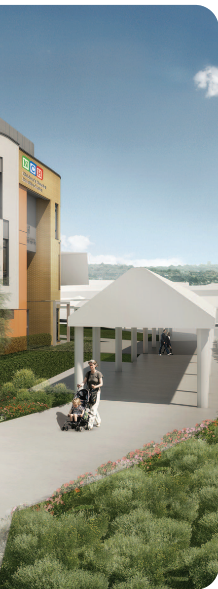
▲ TALLAGHT PAEDIATRIC OPD & URGENT CARE CENTRE