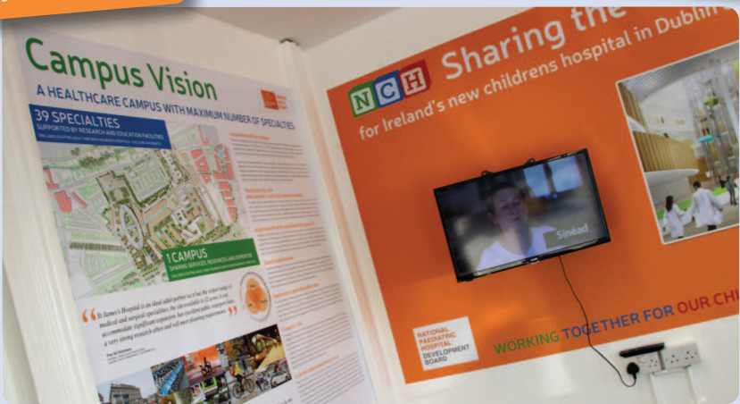
▲ MODEL OF THE NEW CHILDRENS HOSPITAL CAN BE SEEN AT THE NEW INFORMATION CENTRE www.nchplanning.ie