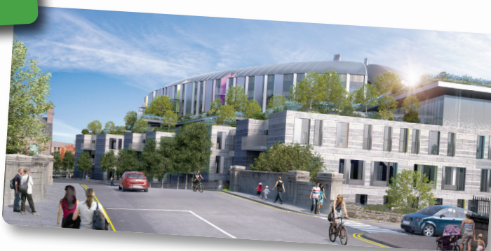
VIEW FROM RIALTO BRIDGE ▲

Main activities to be carried out over the coming months are detailed overleaf.