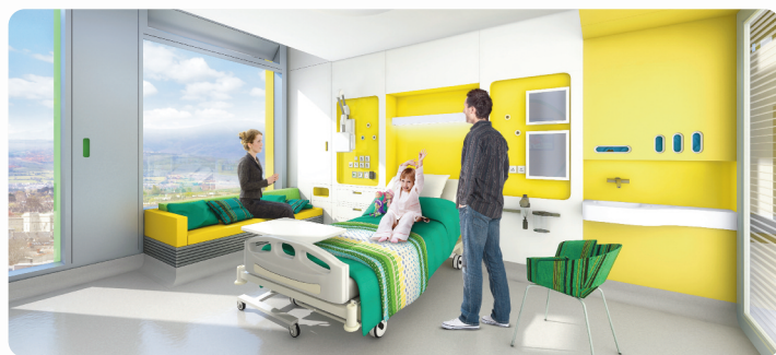
SINGLE BEDROOM ▲

For enquiries on enabling works 24/7 helpline 01 531 1110 / info@bamcontractors.ie