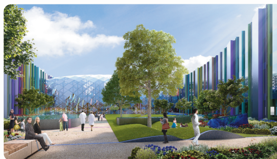
RAINBOW GARDEN ▲