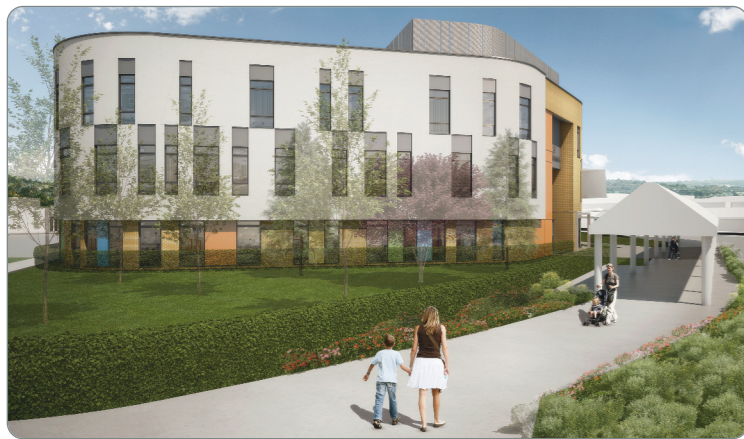
▲ PAEDIATRIC OPD AND URGENT CARE SATELLITE CENTRE TALLAGHT HOSPITAL