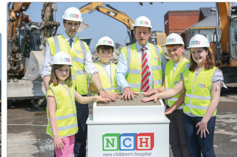
▲ PICTURED CASTING THE FOUNDATION STONE AT NEW CHILDREN'S HOSPITAL ON THE ST JAMES'S HOSPITAL CAMPUS WERE MINISTER FOR HEALTH, SIMON HARRIS T.D. TAOISEACH ENDA KENNY T.D. WITH MEMBERS OF THE YOUTH ADVISORY COUNCIL (YAC). YAC IS MADE UP OF CURRENT AND PAST USERS OF THE EXISTING THREE CHILDREN'S HOSPITALS IN DUBLIN.