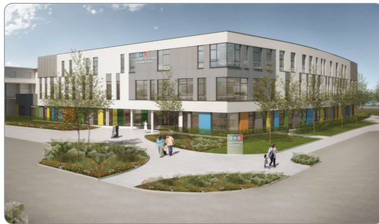
▲ PAEDIATRIC OPD AND URGENT CARE SATELLITE CENTRE CONNOLLY HOSPITAL