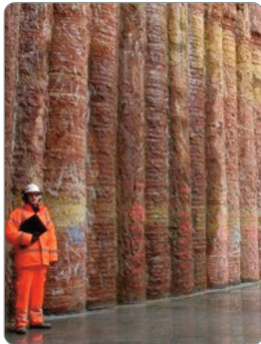
▲ BASEMENT WALLS ARE FORMED USING SECANT PILES A MAJOR ADVANTAGES OF THIS METHOD IS THAT IT IS LESS NOISY THAT OTHER PILING