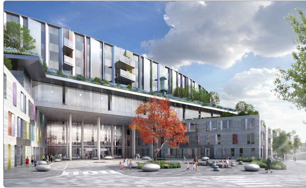
▲ PLAZA AT SOUTH CIRCULAR ROAD