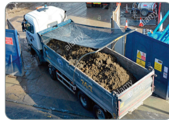
▲ COVERED BODY LORRY