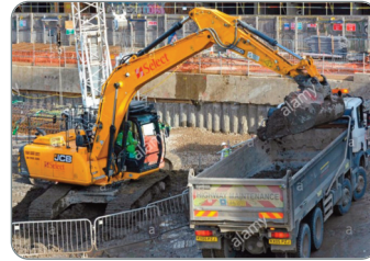
▲ EXCAVATOR LOADING LORRY