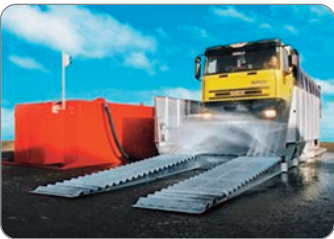
▲ TRUCK WASHING SYSTEM