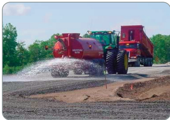
▲ WATER SPRAYER