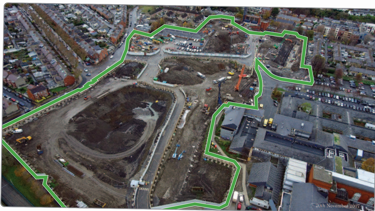
▲ AERIAL VIEW OF NEW CHILDREN'S HOSPITAL SITE ON A SHARED CAMPUS WITH ST. JAMES'S HOSPITAL